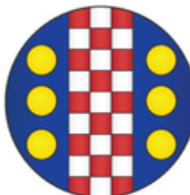
Exchequer Magnus Surtsson