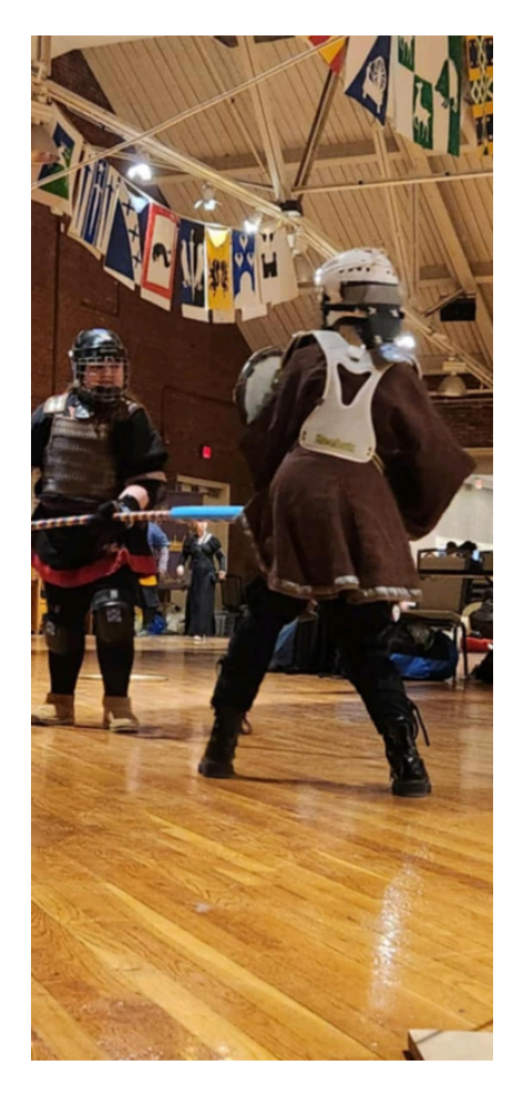
Kaydance of Ravensbridge

This years Birka was filled with lots of recognition for some of our deserving members of Ravensbridge.